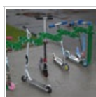
Scooter parking spaces 0 spaces