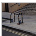
Sheffield stand 0 cycle parking spaces