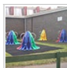
Other cycling parking spaces 6 spaces