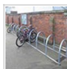
Cycle racks 0 cycle parking spaces