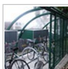
Helmet lockers 0 lockers