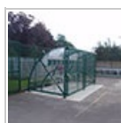
Covered sheffield stand 0 cycle parking spaces