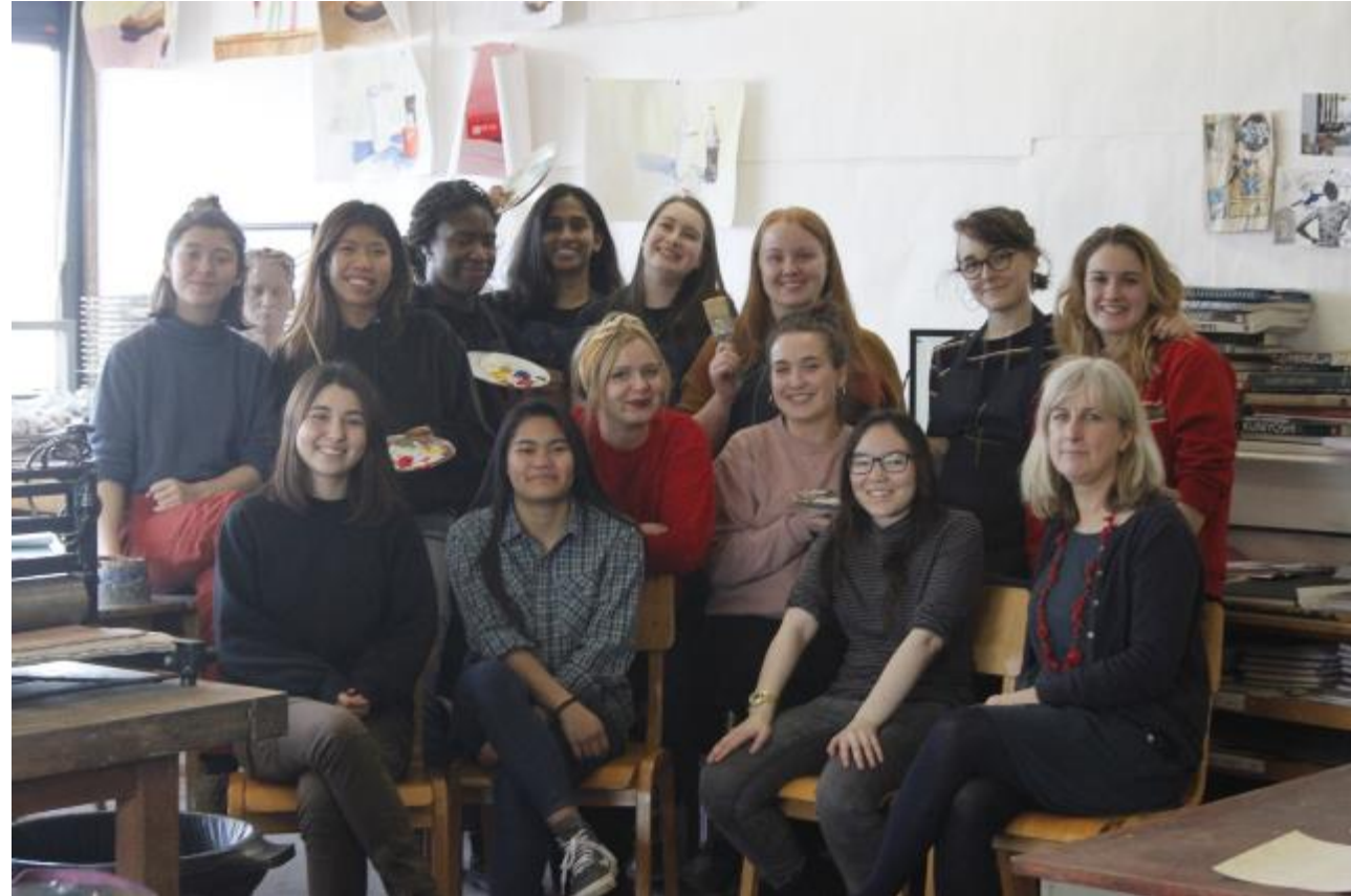
Yr13 Artists and teachers 2018