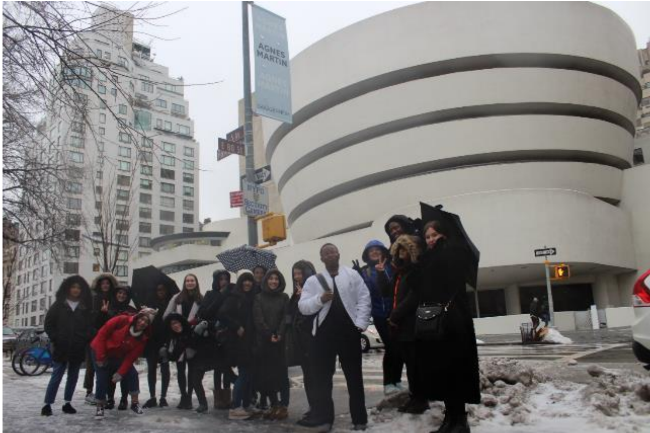
NYC trip Feb 2017 to support students exam preparation

We have taken trips overseas to explore art